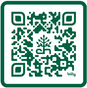
Scan for more information